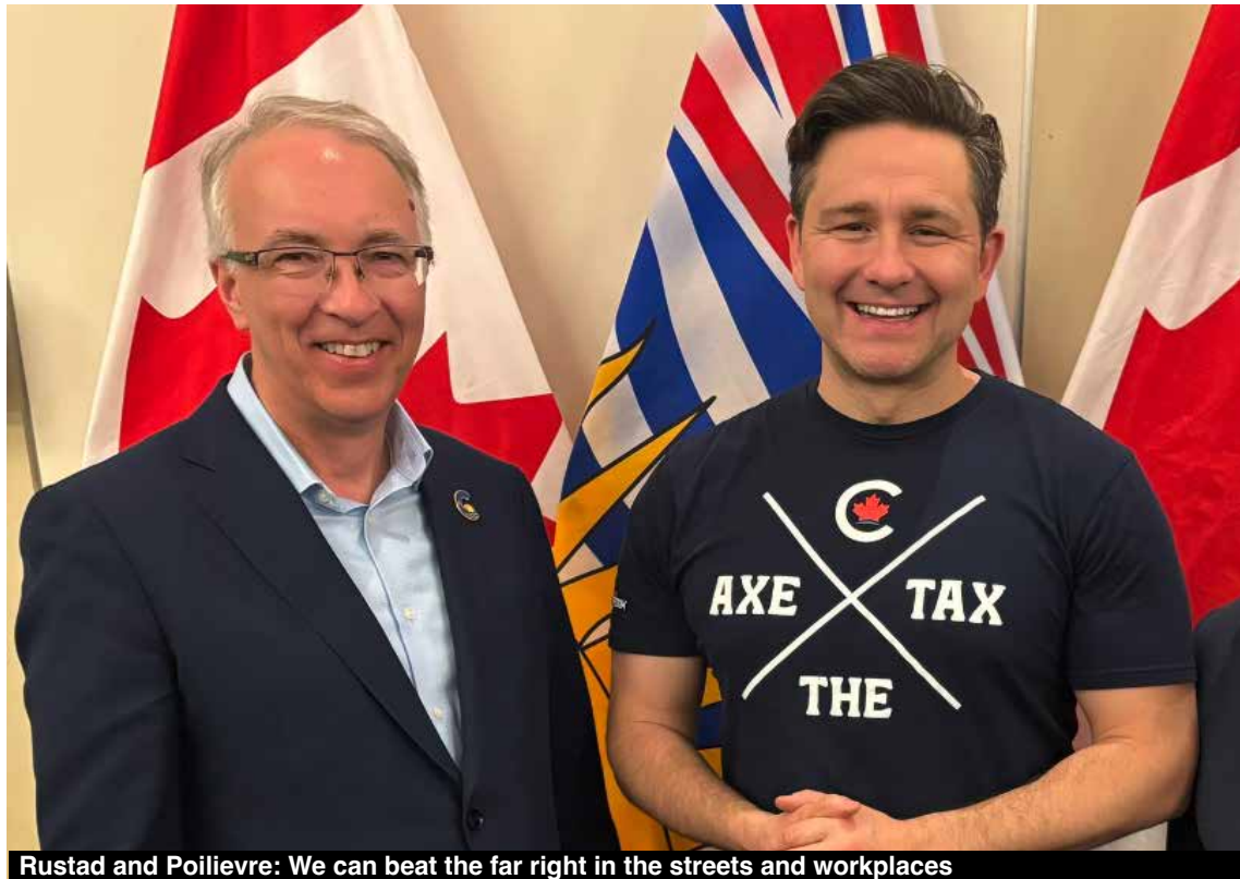
Rustad and Poilievre: We can beat the far right in the streets and workplaces

Rustad will also attack our already failing health care system. Privatization and funding cuts will be introduced as "choice and competition."