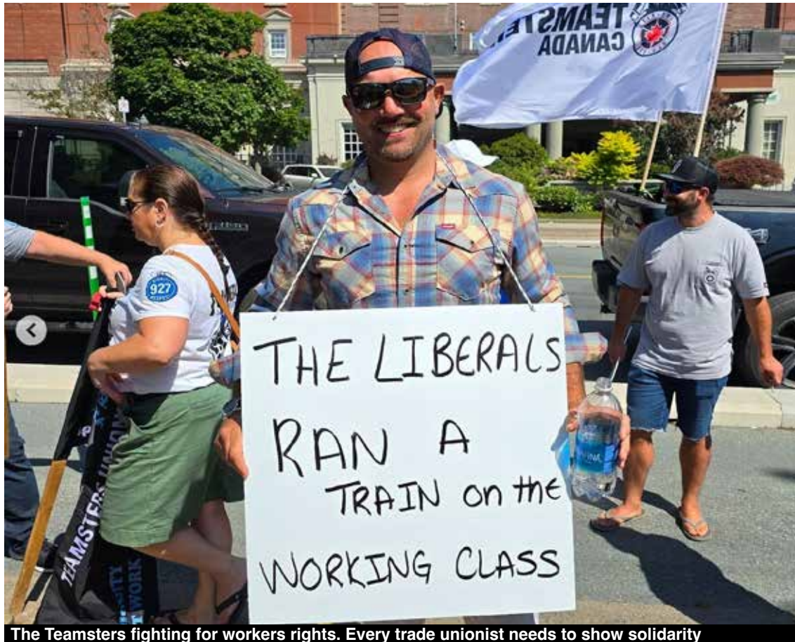
The Teamsters fighting for workers rights. Every trade unionist needs to show solidarity

We need to rebuild rank and file power in our unions to challenge the status quo approach of the union leaders.