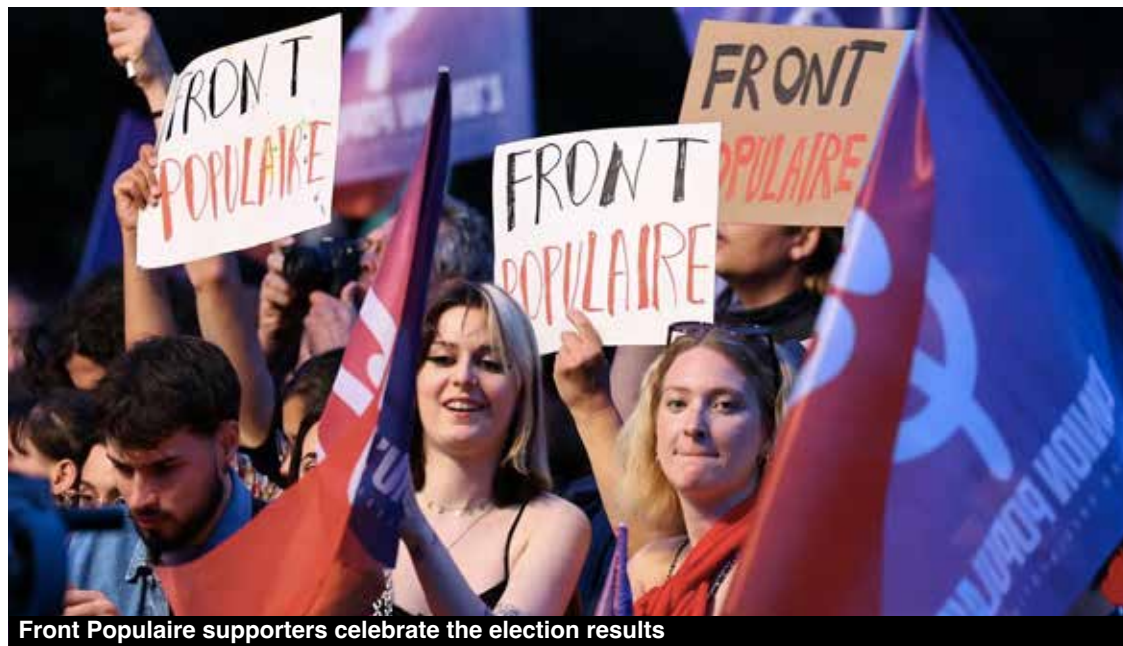
Front Populaire supporters celebrate the election results

When the Liberals are under attack for policies that drive down living standards, we should kick them when they’re down, not try to save them. And build movements that can stop the growth of fascists here before they can get anywhere near their size in