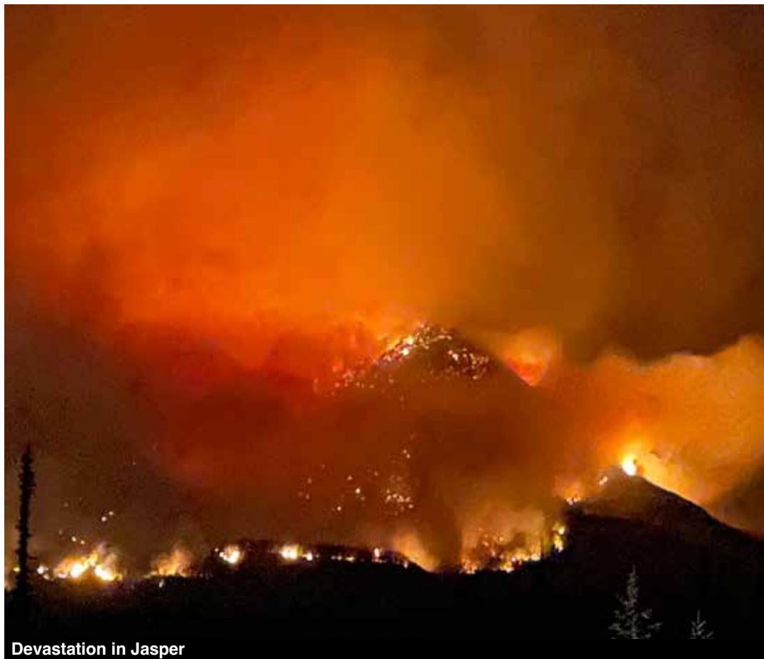
Devastation in Jasper

grees – a Belgian tourist who lost his flip flops suffered severe burns to his feet.