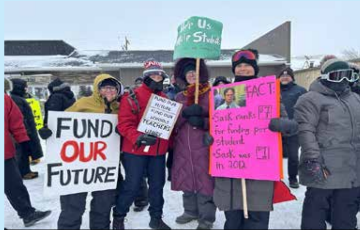
Saskatchewan teachers are on the front link against Scott Moe

Not only might the lacklustre NDP hand over another victory to the vicious politicians of the Saskatchewan Party—their failure to offer a serious alternative could push the political spectrum even further to the right.