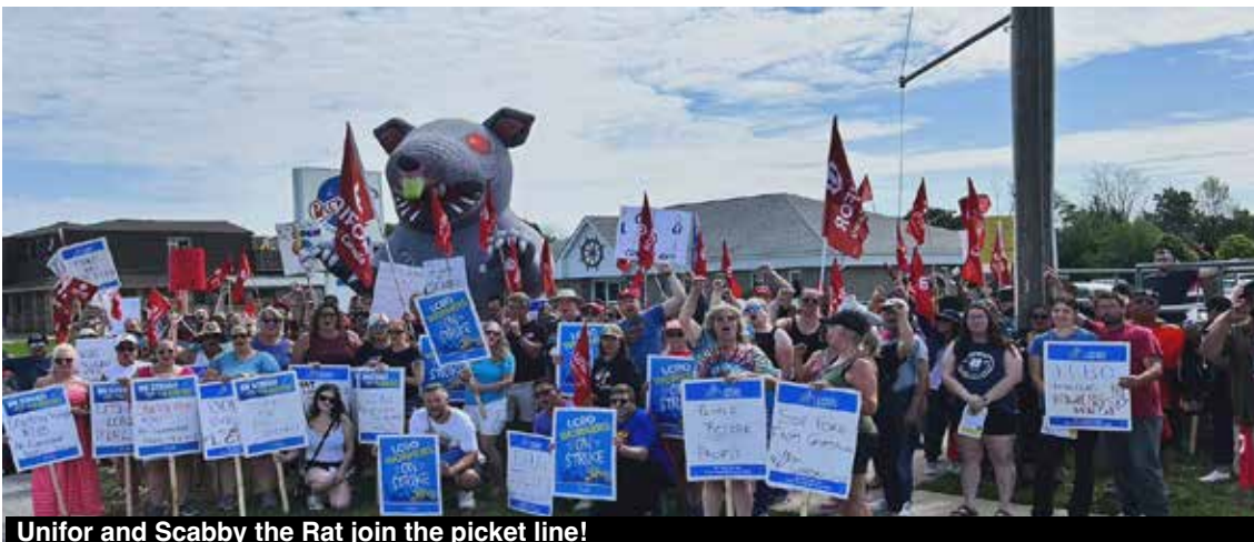
Unifor and Scabby the Rat join the picket line!

As Ford continues to attack workers and the public sector, uniting the fightback will be of utmost importance in the days ahead.