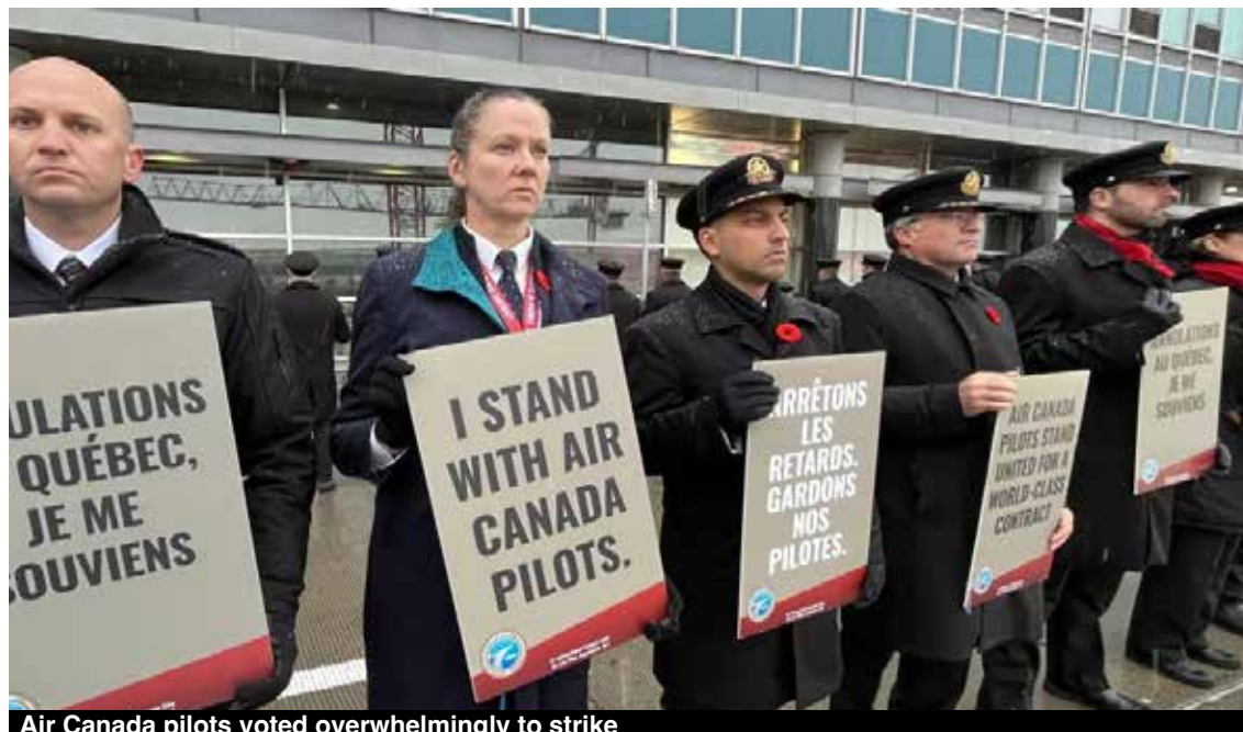
Air Canada pilots voted overwhelmingly to strike

The strike by engineers, conductors and yard crews is about