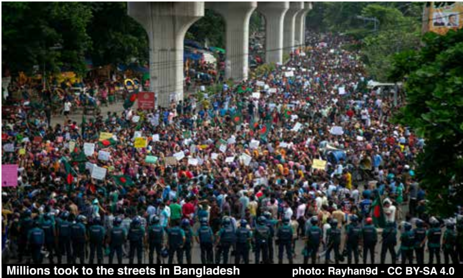
Millions took to the streets in Bangladesh

ervation, a massive 30%, was accorded in 1972 to the descendants of those who participated in