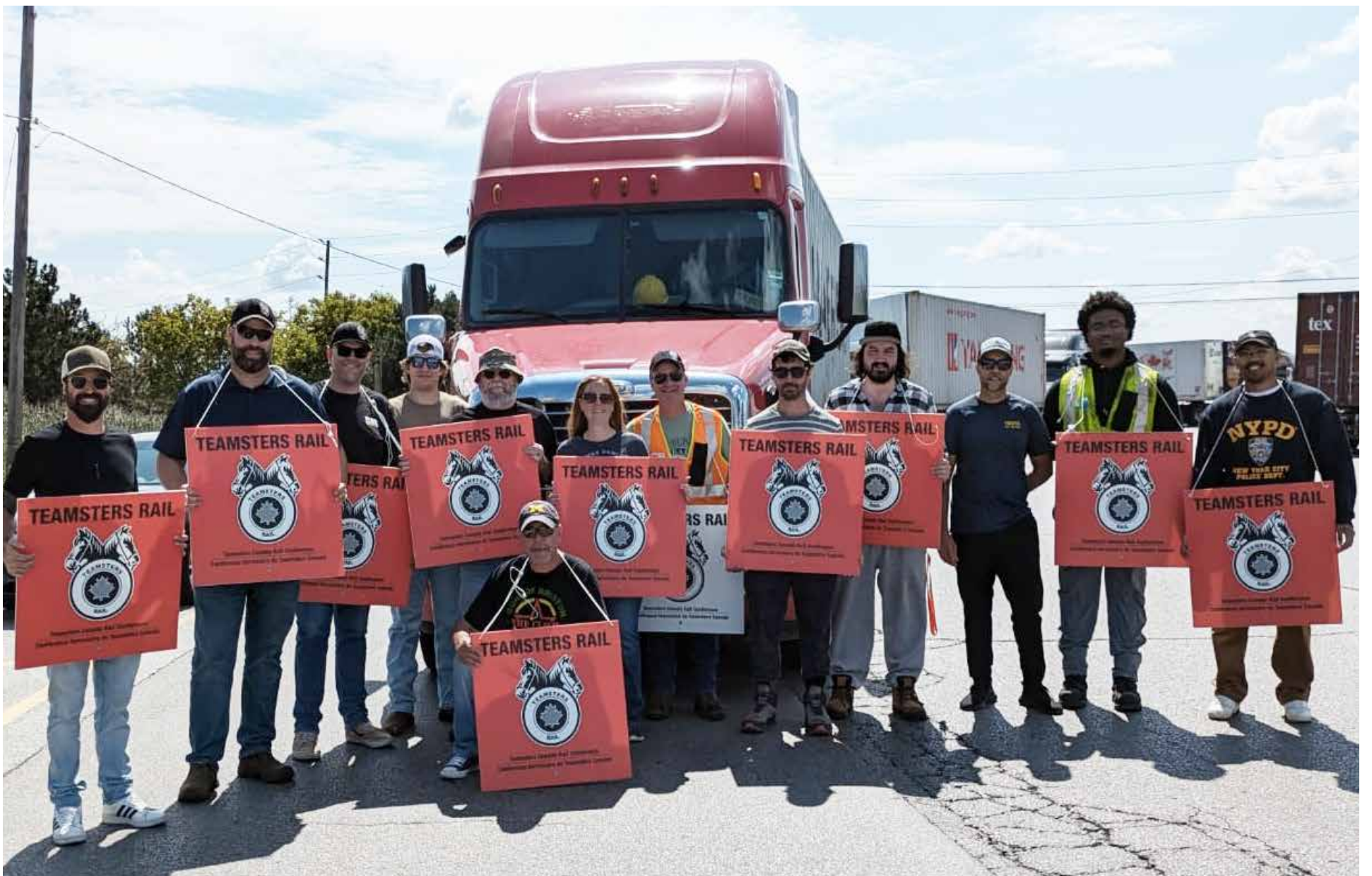
Teamsters rail workers are fighting for the right to strike while the anti-union Liberals force binding arbitration. Story on page 2.